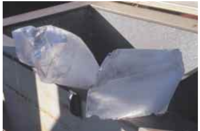
Above: About ten pounds of ice are created in one cycle of ammonia evaporation / condensation.

As the generator cools, the night cycle begins. The calcium chloride reabsorbs ammonia gas, pulling it back through the condenser coil as it evaporates out of the tank in the insulated box. The evaporation of the ammonia removes large quantities of heat from the collector tank and the water surrounding it. How much heat a given refrigerant will absorb depends on its "heat of vaporization," — the amount of energy required to evaporate a certain amount of that refrigerant. Few