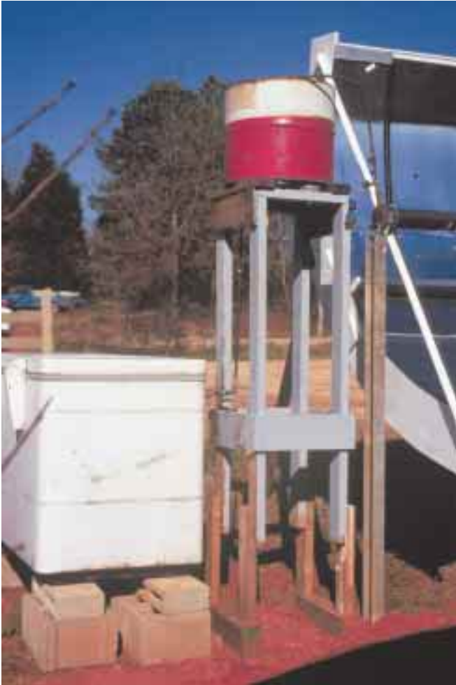
Above: Detail of the condenser bath, containing the condenser coil, and the icemaker box below.

The generator is a three-inch non-galvanized steel pipe positioned at the focus of a parabolic trough collector. The generator is oriented east-west, so that only seasonal and not daily tracking of the collector is required. During construction, calcium chloride is placed in the generator, which is then capped closed. Pure (anhydrous) ammonia obtained in a pressurized tank is allowed to evaporate through a valve into the generator and is absorbed by the salt molecules, forming a calcium chloride-ammonia solution ( \text{CaCl}_2 \cdot 8\text{NH}_3 ).